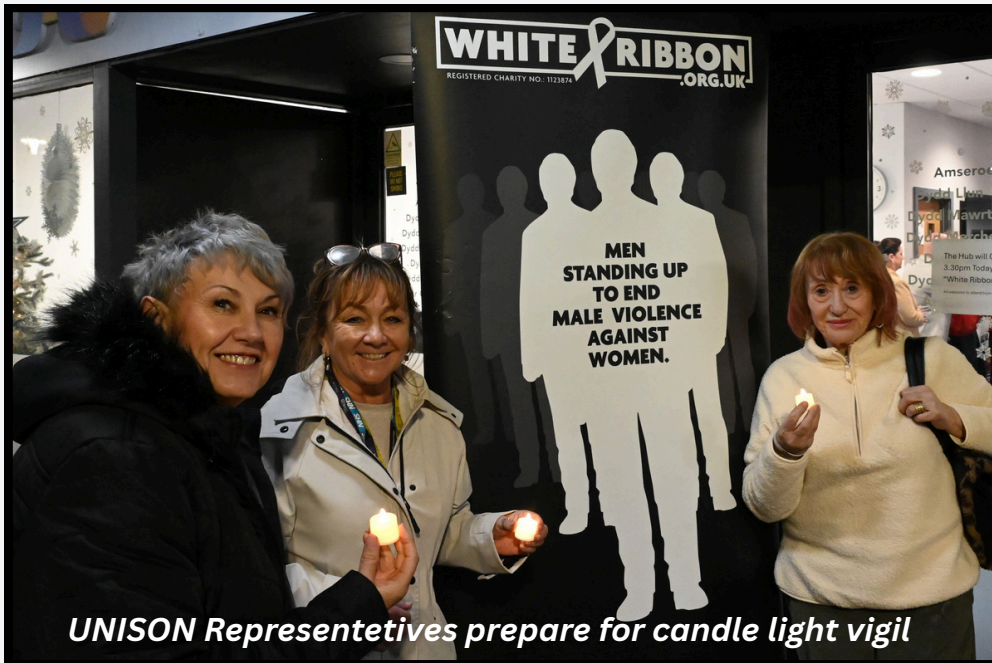
UNISON Representatives prepare for candle light vigil